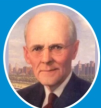
Rtn. Paul Harris Founder